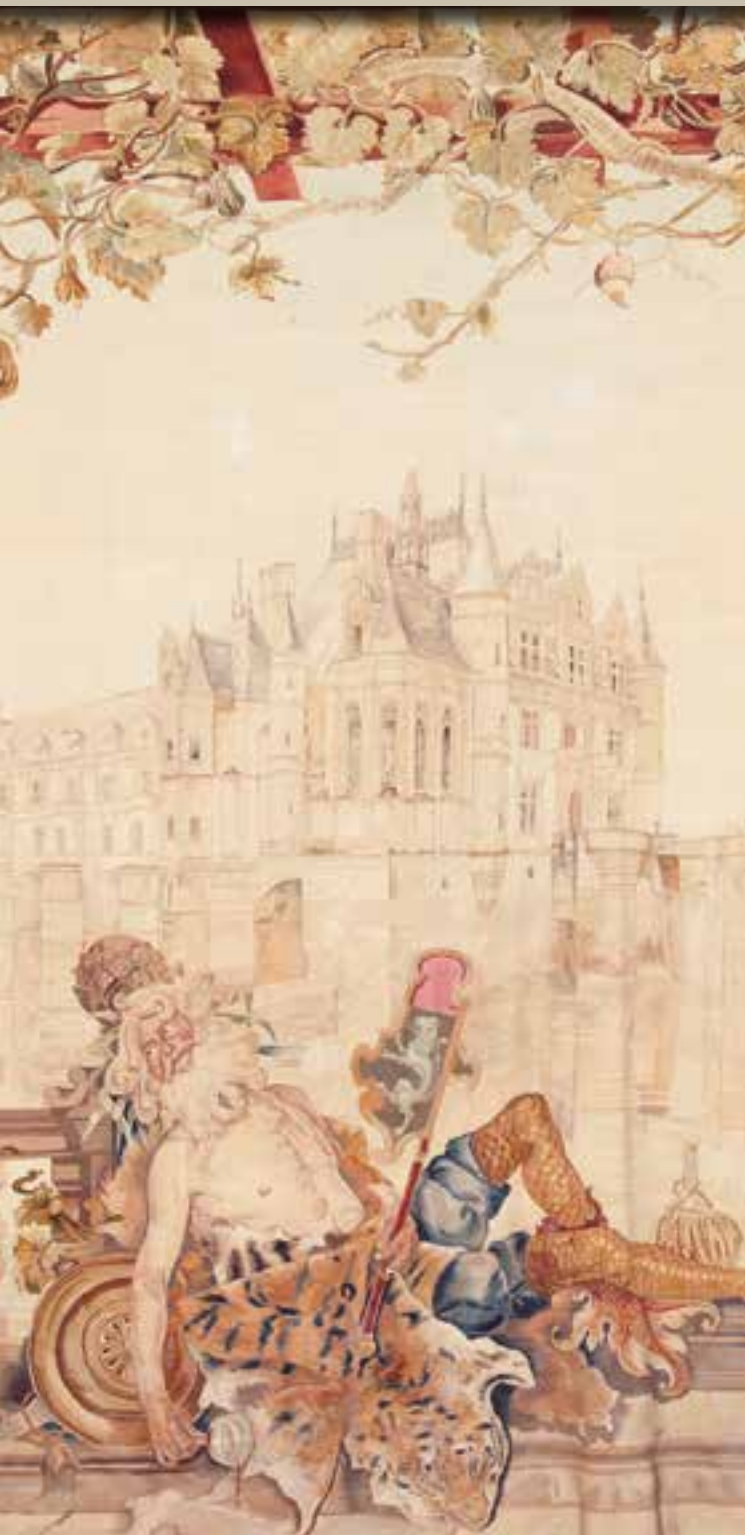
19th century Neuilly Tapestry. "Chenonceau and the allegory of the Cher". Walmez