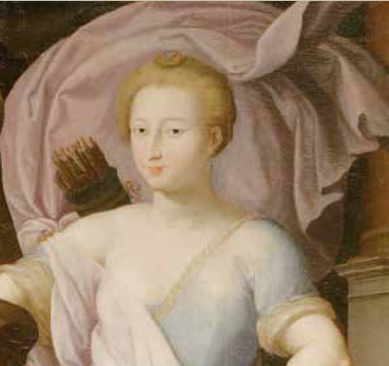
Diane de Poitiers