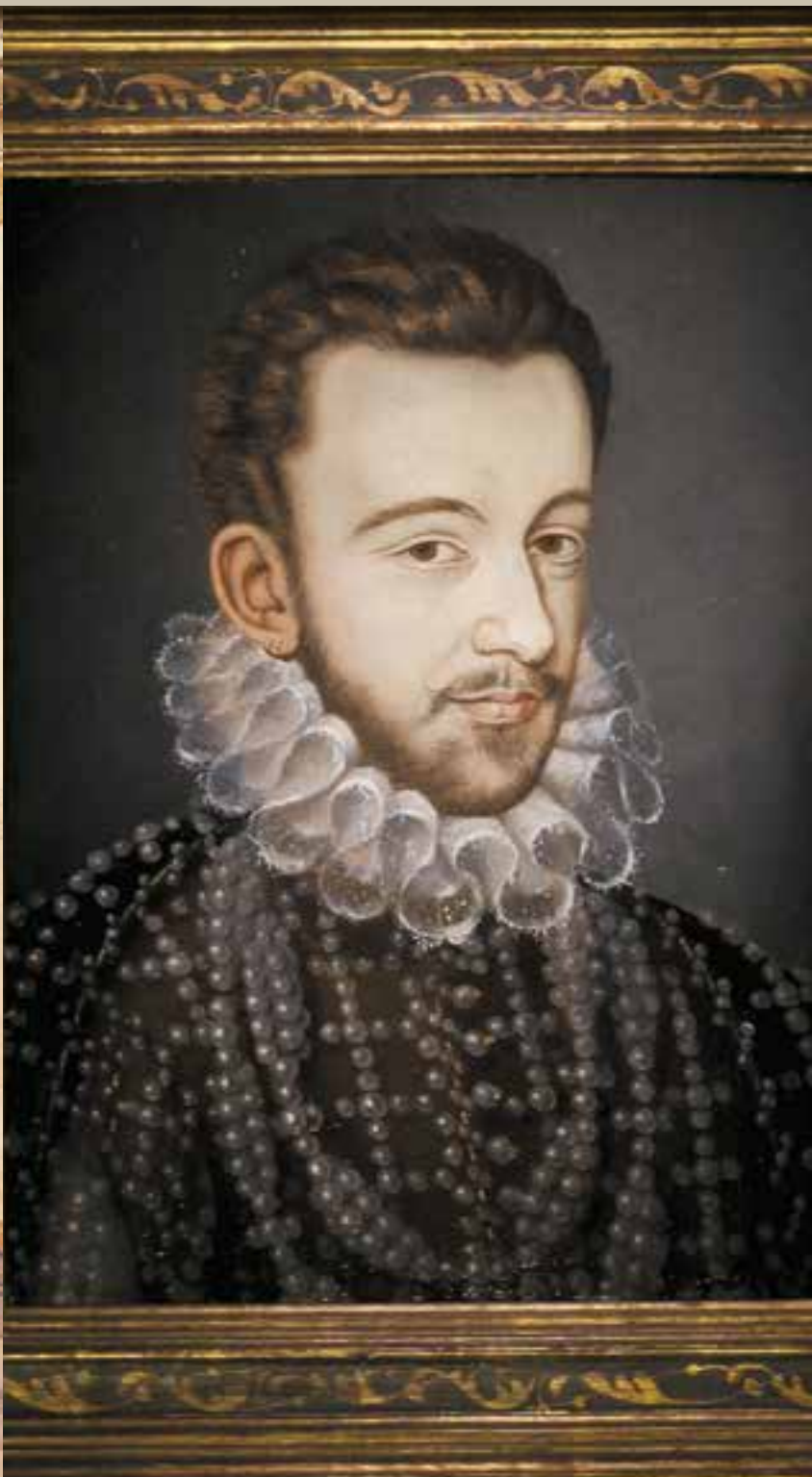
Portrait of Henri III. François Clouet