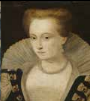
Louise de Lorraine