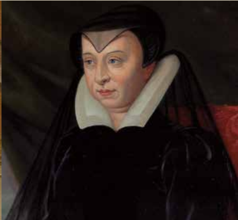
Catherine de Médici